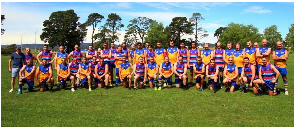
ACT Masters v Defence, RMC Duntroon, Remembrance Day 2021

In July, the ACT Masters kicked off a pilot four-game competition, the Canberra Heart Mind & Soul Cup, bringing together four Canberra teams—the ACT Masters Cockies, the Weston Creek Wildcats, the Honeybadgers from the Australian Staff College Weston and the Australian National University's Griffins—in a 4-round schedule of live streamed (by Cluch TV ) double-header games under lights on a Friday night each month through to October.